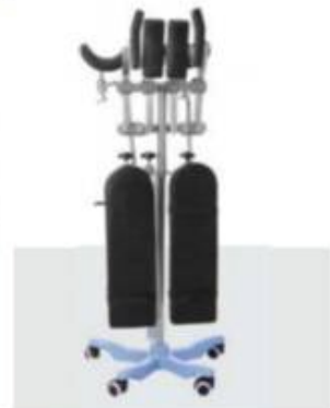
ACCESSORIES STAND OA-23