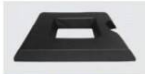
SPINE SURGERY USING CUSHION SPINE FRAME OA-10