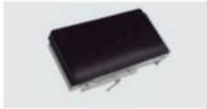
SPLIT LEG SECTION OA-1