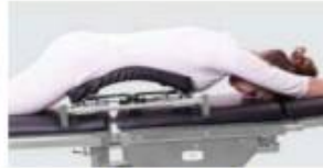
CERVICAL IN SUPINE / LAMINECTOMY FRAME OA-6