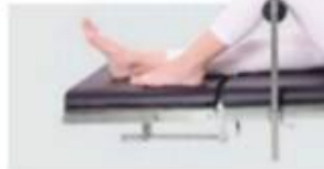
KNEE SUPPORT OA-14