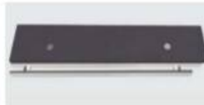
WIDTH EXTENSION OA-18