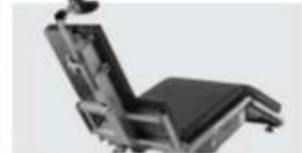
SHOULDER SURGERY OA-16