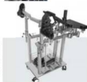
ORTHOPAEDIC ATTACHMENT STAND OA-22