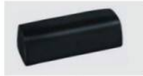
BOLSTER PILLOW OA-3