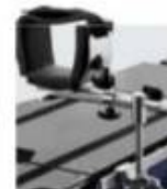
ARTHROSCOPY ATTACHMENT OA-19