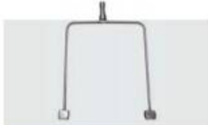
STEINMANN PIN CLAMP HOLDER OA-9