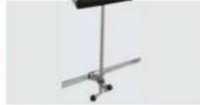
HUMERUS SUPPORT OA-7