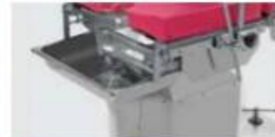
UROLOGY / GYNAE TRAY OA-12