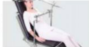
FIXATOR FOR SITTING POSITION OA-15