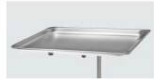
INSTRUMENT TRAY OA-4