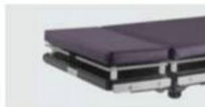
X-RAY TOP allows for inserting X-ray film cassette from head to foot OA-21