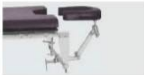
HORSE SHOE OA-13