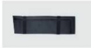
RESTRAINT BODY STRAP OA-2