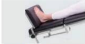
FOOT SUPPORT OA-5