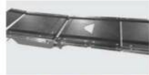
TABLE LENGTH EXTENSION OA-8