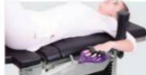
ARM TRACTION DEVICE / PERINEAL POST OA-11